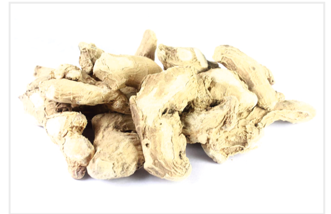
DRY GINGER (SONTH)