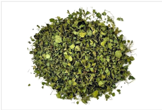
DRIED FENUGREEK (KASURI METHI)