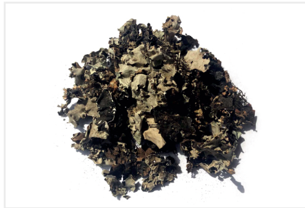
BLACK STONE FLOWER (KALPASI)